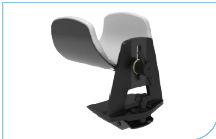
Compact design for improved imaging access